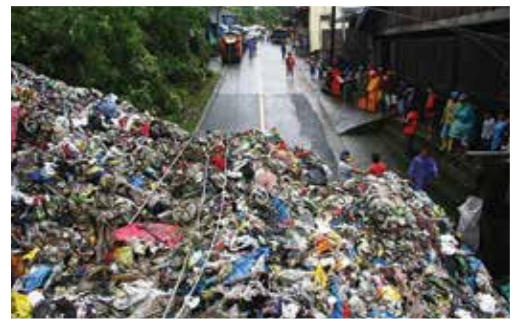
A garbage landslide in China claimed 75 lives in 2015.

"Preach the word! ... Convince, rebuke, exhort, with all longsuffering and teaching. For the time will come when they will not endure sound doctrine, but according to their own desires, because they have itching ears, they will heap up for themselves teachers; and they will turn their ears away from the truth, and be turned aside to fables" (2 Timothy 4:2–4).