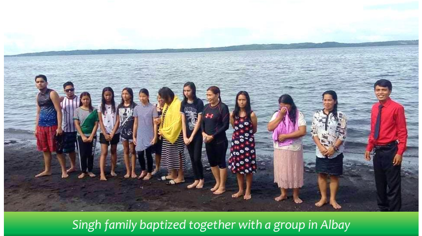
Singh family baptized together with a group in Albay

On September 19 & 26, seven more souls responded to be baptized after completing the Online Bible Study Courses. They came from Tarlac, Albay, and Pasay City.