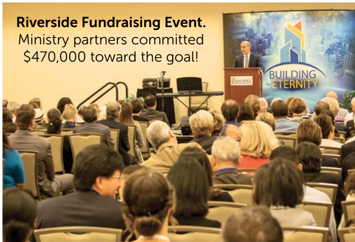
Riverside Fundraising Event. Ministry partners committed $470,000 toward the goal!