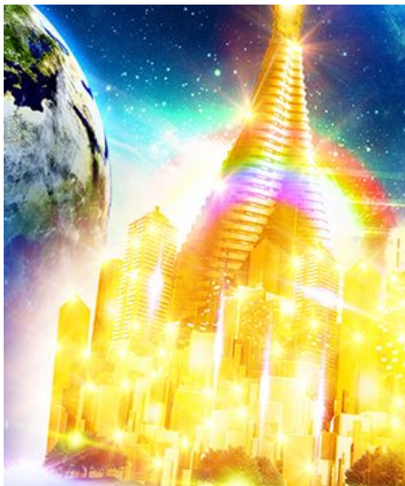
The holy city, along with all God's people, will descend to earth at the close of the 1,000 years.