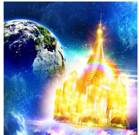
Third coming with the holy city and all righteous people at the close of the 1,000 years.