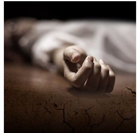
The wicked will lay dead upon the earth during the 1,000 years.

earth. The righteous will all be in heaven. All the wicked will be laying dead upon the earth. Revelation 22:11, 12 makes it clear that the case of every person is closed before Jesus returns. Those who wait to accept Christ until the 1,000 years begin will have waited too long.