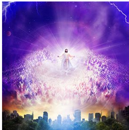
Second coming in the clouds at the beginning of the 1,000 years to take His people to heaven.