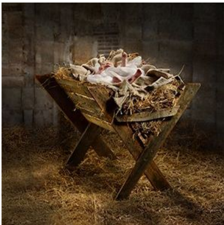
First coming to Bethlehem in a manger.