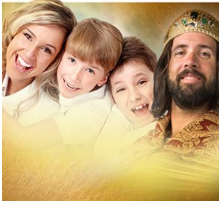
The righteous will be in heaven with Jesus during the 1,000 years.

wicked already dead when Jesus returns will remain in their graves until the end of the 1,000 years.